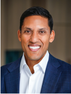
Dr. Rajiv J. Shah President, The Rockefeller Foundation